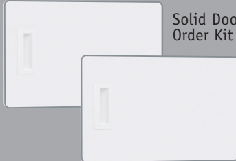
Solid Doors, Order Kit #4396720

New Dual Torx® Security Bolt and Pin Combination secures your investment by prohibiting the separation of dryers.